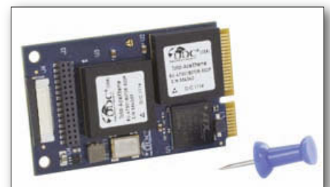
BU-67114H small form factor mini-PCIE board

PMC, XMC, and PC/104-Plus type of form factors can at times be too large and heavy for some applications. Also the demand for lightweight, low-power, rugged, reliable bus interfaces for smaller platforms such as UAVs has increased the demand for small components or small form factor rugged boards. DDC