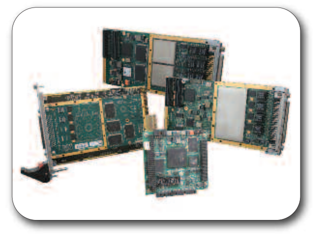
Figure 1. Various DDC MIL-STD-1553 and ARINC 429 boards

This article describes the MIL-STD-1553 and ARINC 429 standards and their differences in detail, and introduces a wide range of components, test boards, rugged embedded boards, rugged small form factor boards and software corresponding to these standards.