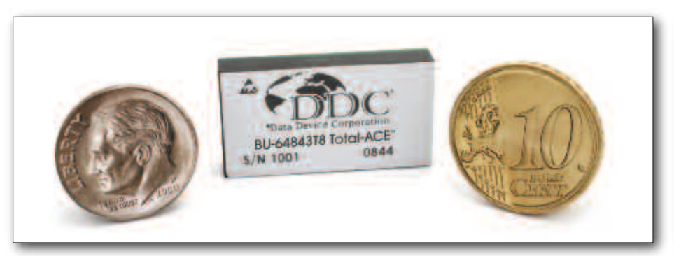
Figure 2. Total-ACE integrates MIL-STD-1553 components within a single, small, cost-effective plastic BGA package.

has the ability to inhibit the transmitters for monitoring-only applications, or disable the bus controller for RT-only applications on a channel-by-channel basis. This is done via a customer configuration utility that is run once on the card. Once each 1553 channel on the card is configured in the desired manner, host software cannot change this configuration. If the software commands the card to transmit data as a bus controller on channel one, the hardware will not do so if the defined channel is inhibited or BC-disabled. DDC offers this capability as a standard feature with each of the AceXtreme PMC, PCI, cPCI, PC/104-Plus and PCI-104 cards. These features are usually requirements for customers who deal with flight safety critical applications to satisfy very strict security requirements. Some safety-critical applications require the monitoring of a classified data bus while communicating as a remote terminal on another bus. Each card includes the MIL-STD-1553 AceXtreme and Multi-I/O ARINC 429 ANSI C software development kits (SDKs) and drivers to support all modes of operation for 32-bit and 64-bit versions of Linux, VxWorks, Windows 2000/XP, and 32-bit and 64-bit versions of Windows